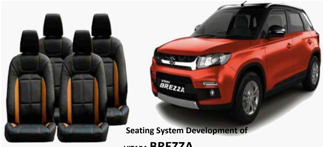
Seating System Development of VITARA BREZZA